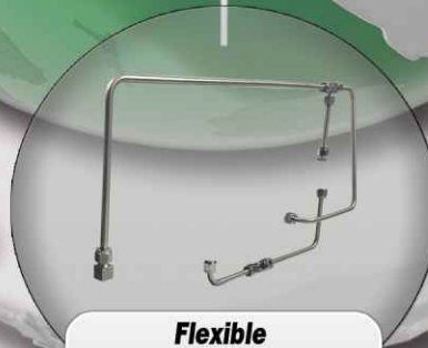
Flexible and Hard Stainless Steel Hoses