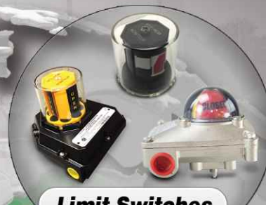
Limit Switches with Indicator