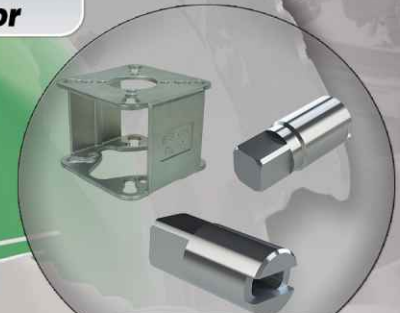
Brackets and Couplers