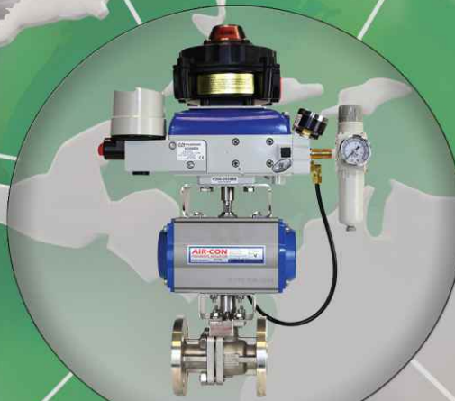
Complete Actuator Packages