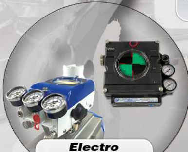
Electro Pneumatic Smart Positioners