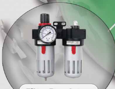
Filter Regulators and Lubricators