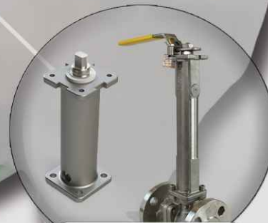
Stem Extensions and Cryogenic Tops

Air-Con's products are used in almost every energy related industry, including oil and gas production, oil and gas transmission, and petroleum refining. Other markets include chemical, petrochemical, pulp and paper, food and beverage, and water systems.