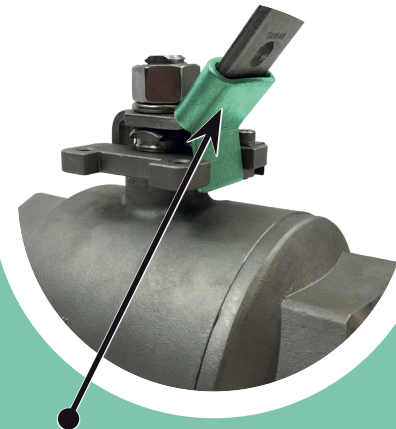
Prevents Installer Error