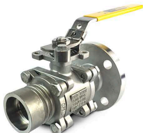
Flanged x Socket (weld in place)