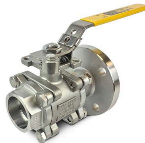
Flanged x Socket Weld