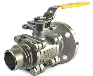
Flanged x Butt (weld in place)