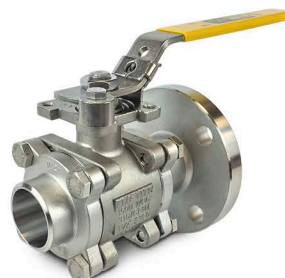
Flanged x Butt Weld