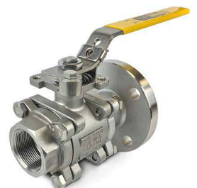
Flanged x Threaded