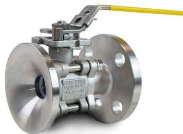
Flanged x Tank Bottom