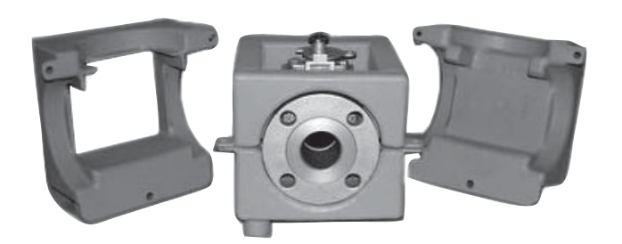
3 & 4 Way Multi-Port Design