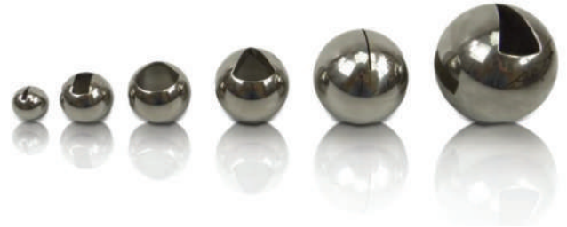
Floating Ball Design